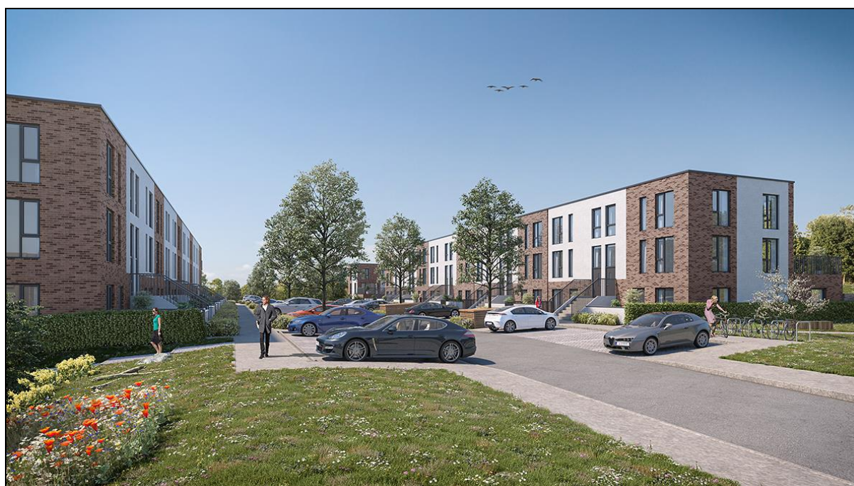
Figure 2 – Proposed Building Design (Duplexes)

Careful consideration was given to the provision of natural daylight within the units. Daylight analysis undertaken by OCSC confirms that the majority of all units exceed the recommendations outlined within the BRE Guide in respect to internal daylight levels, thus reducing the reliance on artificial lighting.