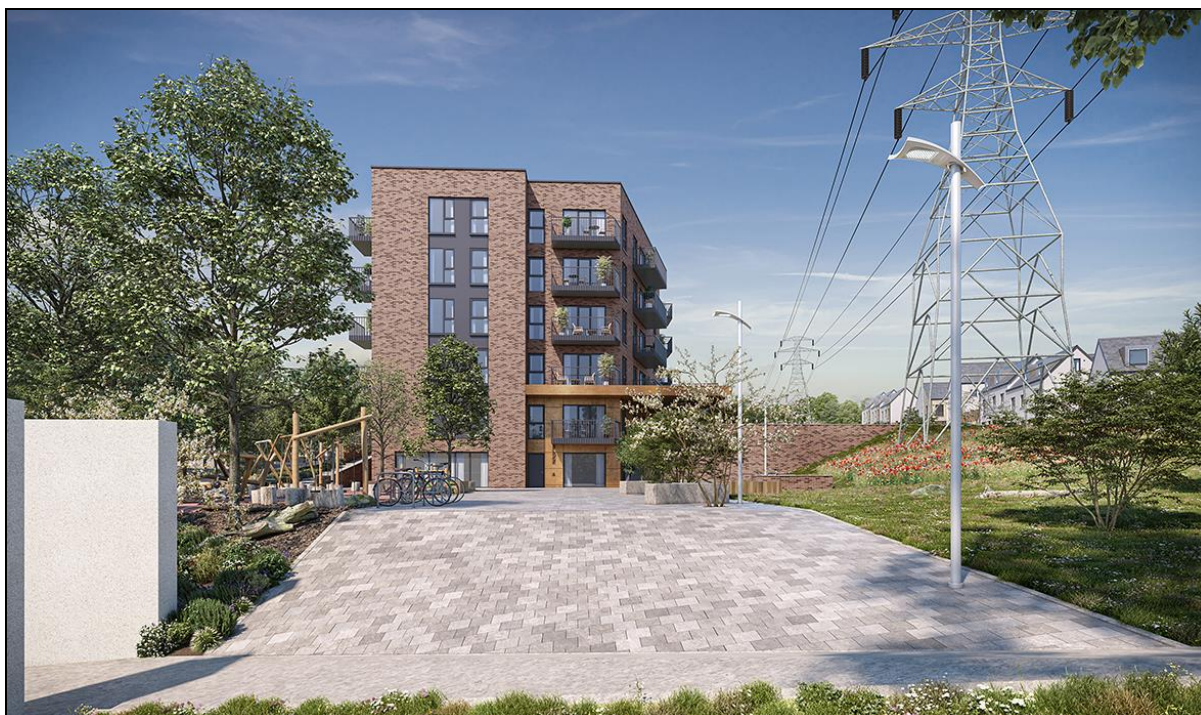
Figure 3 – Durable Building Materials with Low Maintenance Requirements (Apartment Block)

In selecting the materials to be used for the development consideration has been given to Building Regulations and includes reference to BS 7543:2015 'Guide to Durability of Buildings and Building elements, Products and Components'. The materials proposed by Reddy Architecture + Urbanism are modest, considerate and robust and are in keeping with the surrounding environment. The materials have been selected on the basis of durability, resilience, longevity, and low maintenance.