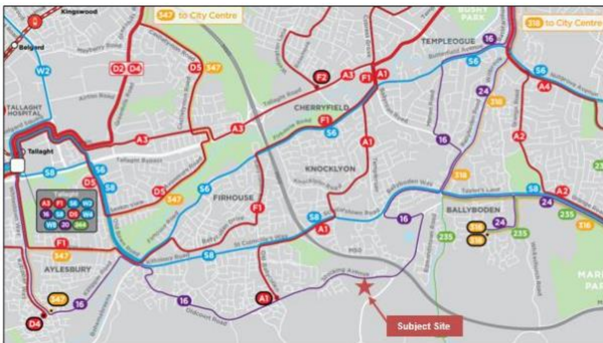
Figure 6 – Proposed BusConnects Routes