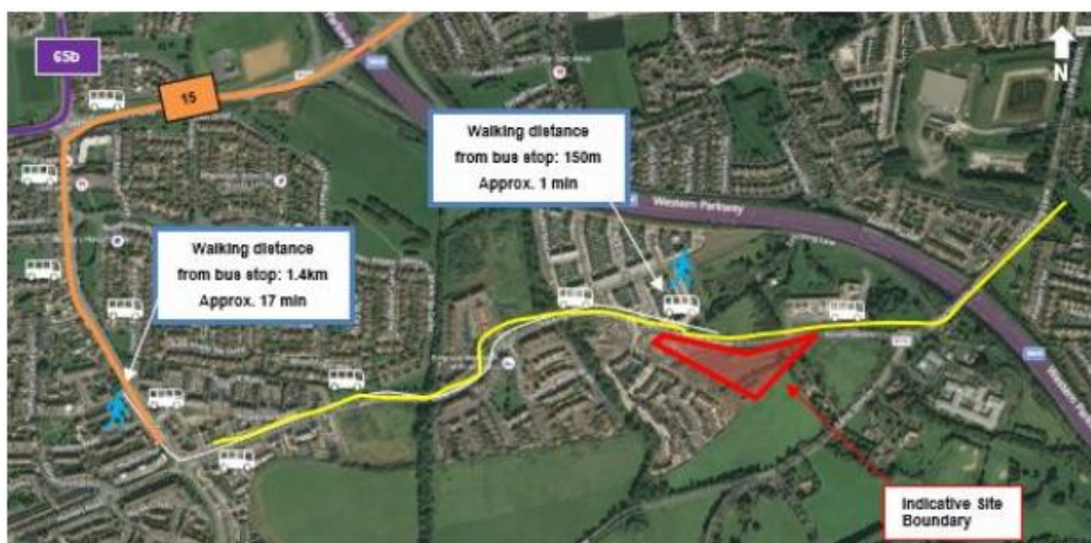
Figure 5 – Existing Bus Transport Linkages

In terms of local bus services, both the 15 and 15b Dublin bus routes operate daily and offer frequent services (i.e. every 10-15 minutes at peak times) along Stocking Avenue (c.150m from the subject site).