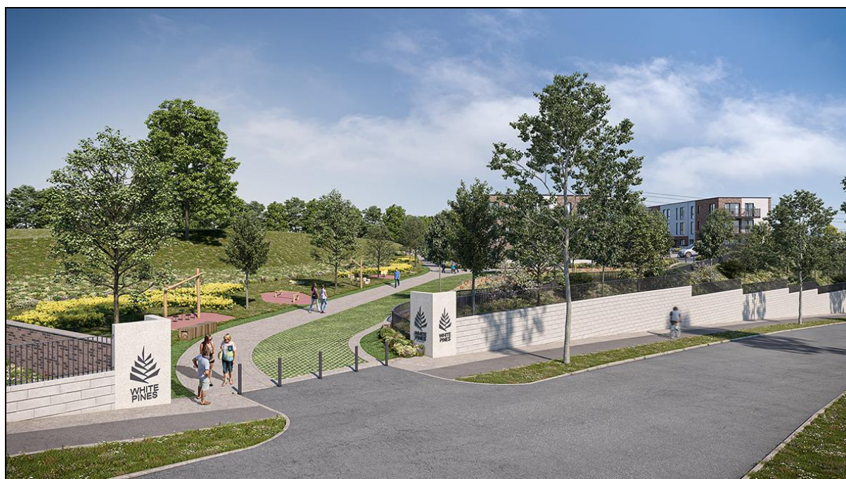
Figure 4 – Proposed Communal Amenity Spaces

Another positive factor in the health and wellbeing of the scheme are the communal amenity spaces. These areas will provide spaces for residents to gather, to relax, to work and to exercise which will foster a sense of community.